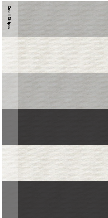
Designed and manufactured in Spain and known for its superb quality with an extensive colour palette.

Visit shadeelements.co.nz to see the full fabric collection.