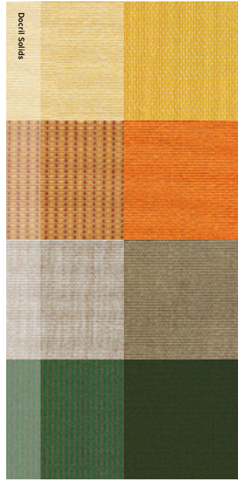
Docril offers an impressive selection of 132 vibrant colours to suit any décor and comes with a 10 year UV warranty.