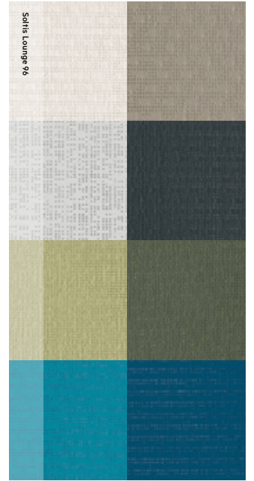
Soltis Lounge 96 is an optimised screen fabric that creates a comfortable ambience for outdoor living spaces. Designed and manufactured in France by Serge Ferrari, Soltis Lounge 96 is lightweight, durable and 100% recyclable. Available in 21 colours.